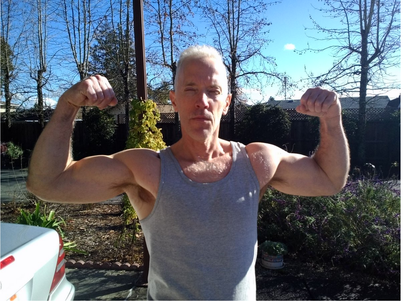
Here's another photo taken two weeks later (in a new shirt).